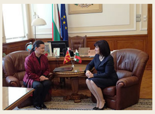
agreed that after the 11-years stalemate in the bilateral relations between the friendship groups, the activities should be intensified and dynamised in the future.